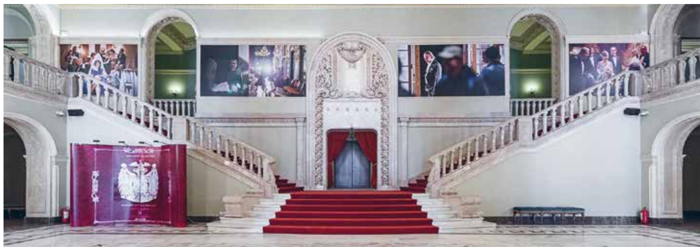
Bucharest National Opera – Entrance hall