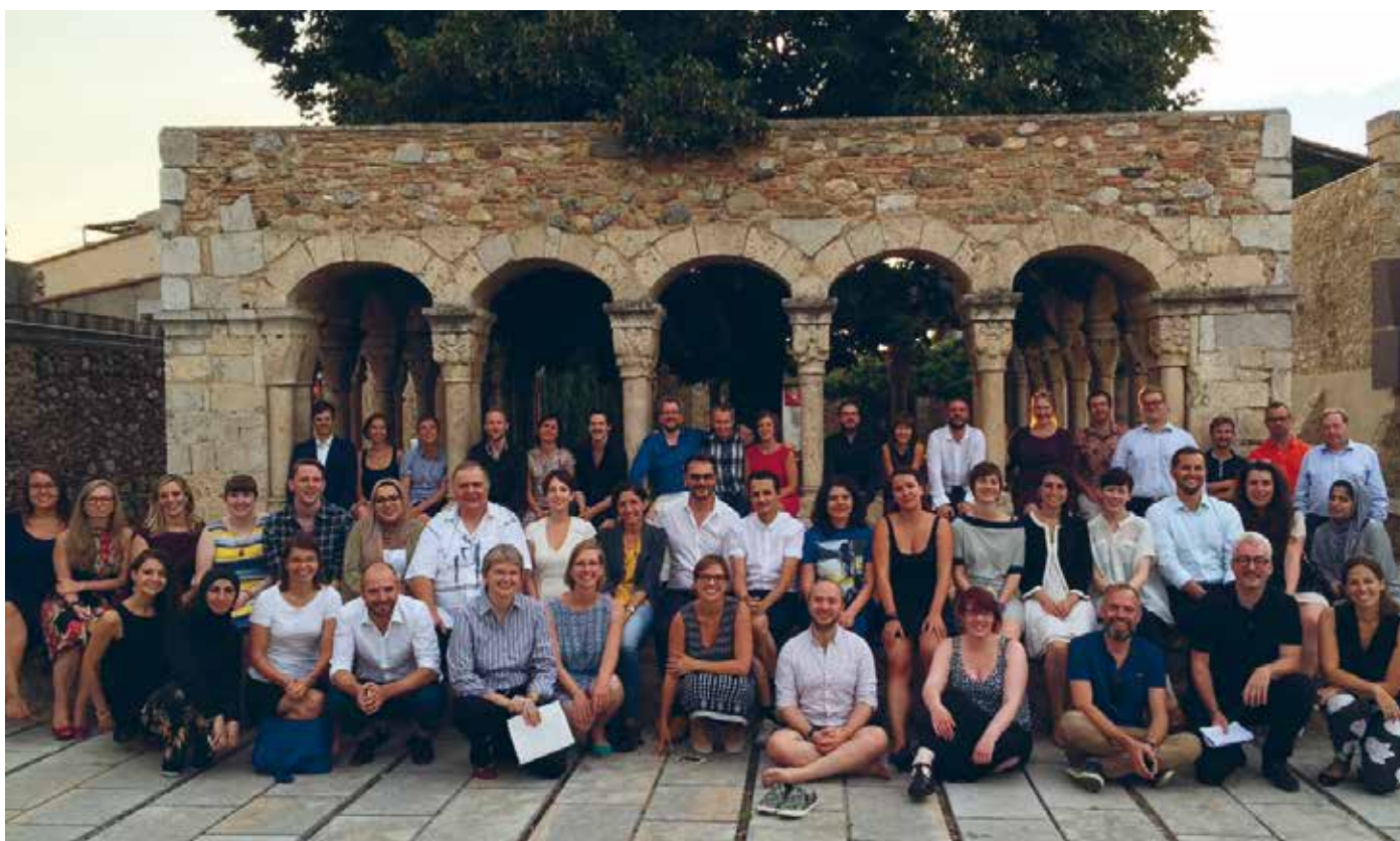
2015 Opera Management Course in Peralada