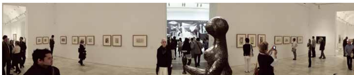
Gallery of Museo Reina Sofía with Picasso's Guernica in the background