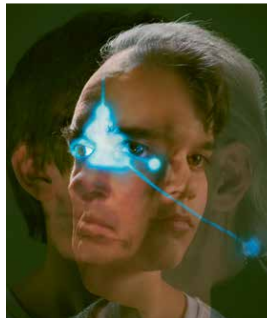
Theatre of the World © Petrovsky &amp; Ramone

A more detailed and timed conference programme will be published later online and in the next newsletter at the beginning of June