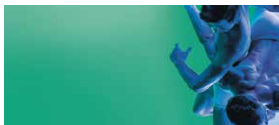
Transatlantic © Petrovsky &amp; Ramone