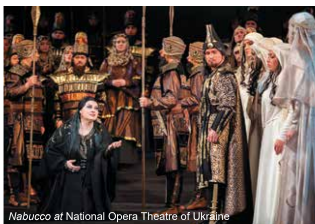
Nabucco at National Opera Theatre of Ukraine