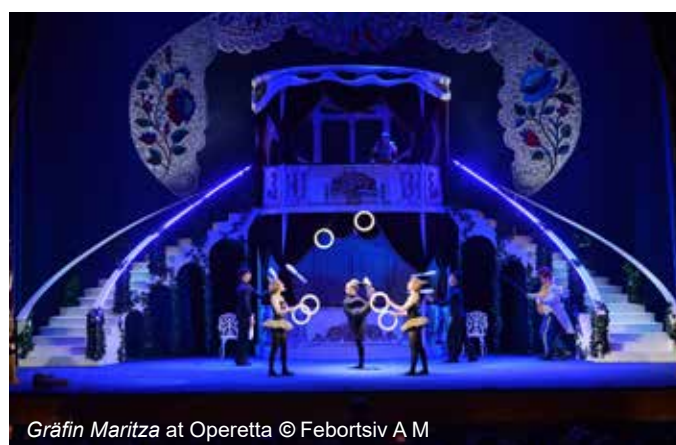
Gräfin Maritza at Operetta