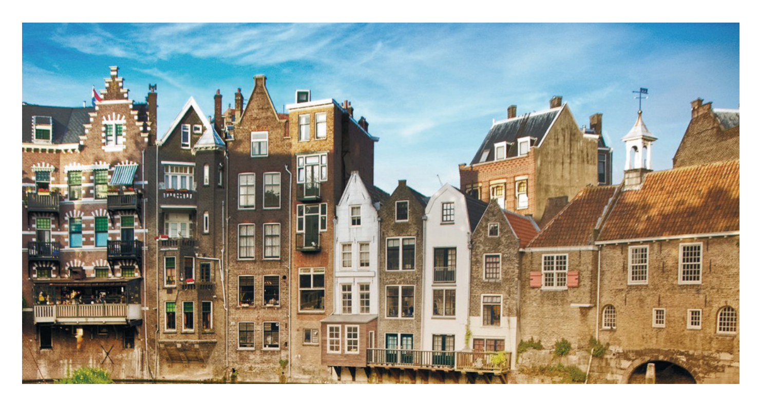
Rotterdam – 22-24 May 2018 Heroic Stories Collaboration between smaller and larger companies and festivals

De vereniging van operahuizen en festivals in Europa