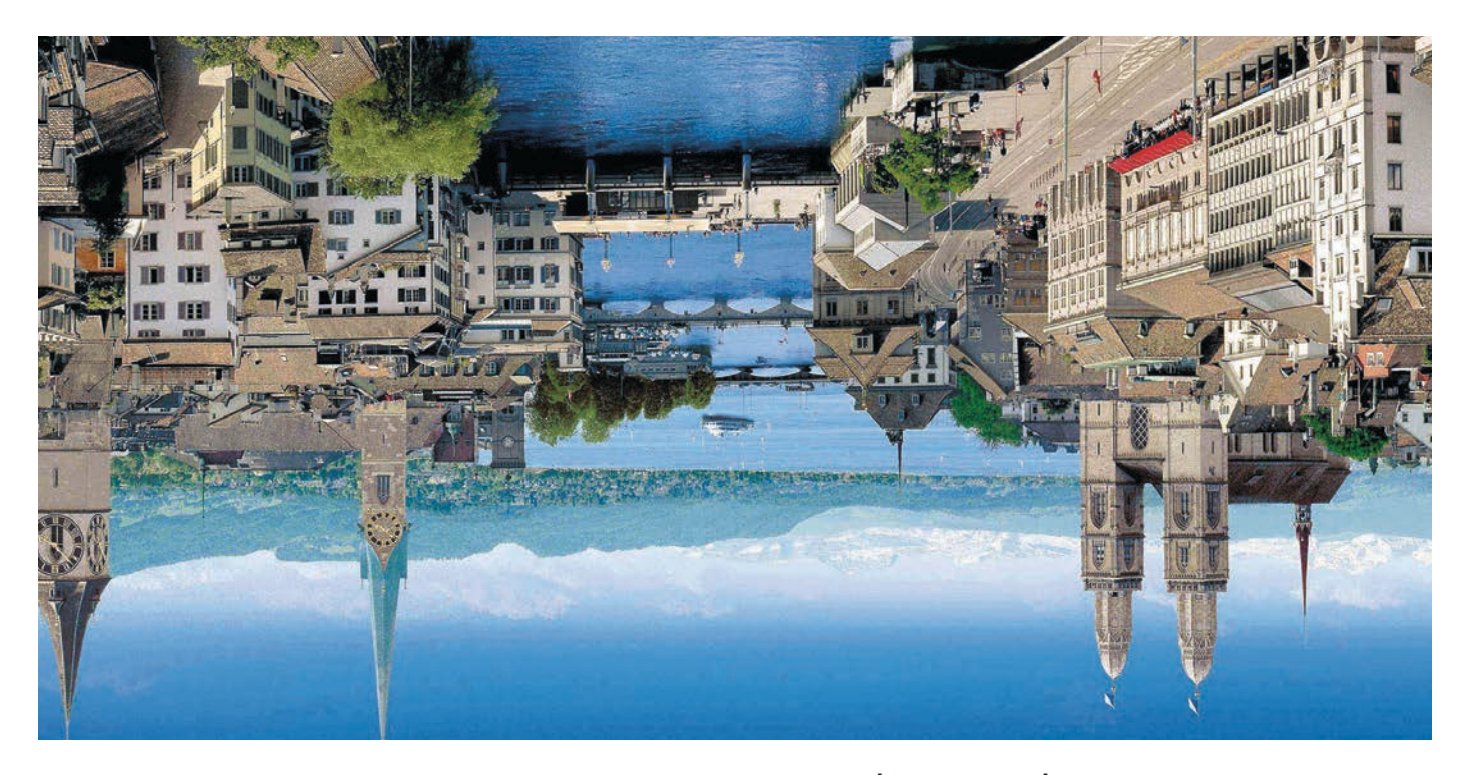
Opernhaus Zürich – 28-30 June Measuring the Arts Opera Europa Summer Conference 2018